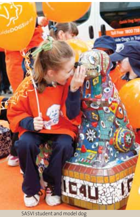
SASVI student and model dog

looked better! Not to be outdone, Guide Dogs SA.NT PR dog, Bella created her own work of art, an abstract water colour on canvas using just her four paws.