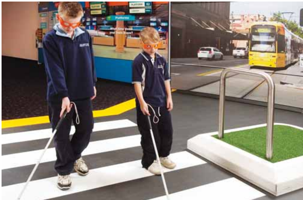
McLaren Vale students take on the 'white cane walk' challenge

Every hour, every day, one Australian learns they will lose their sight. We know that 75 per cent of vision loss is avoidable or treatable, and while noise induced hearing loss is 100 per cent preventable, it is also unfortunately 100 per cent irreversible. Key messages like this, along with advice on how to protect sight and hearing, are the vital