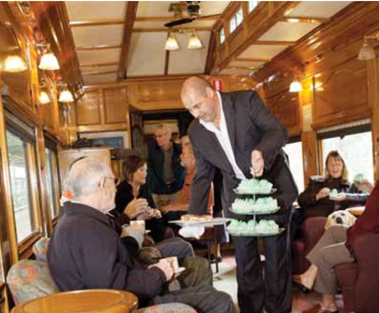
Volunteers enjoying morning tea in the historic Governor's Lounge carriage