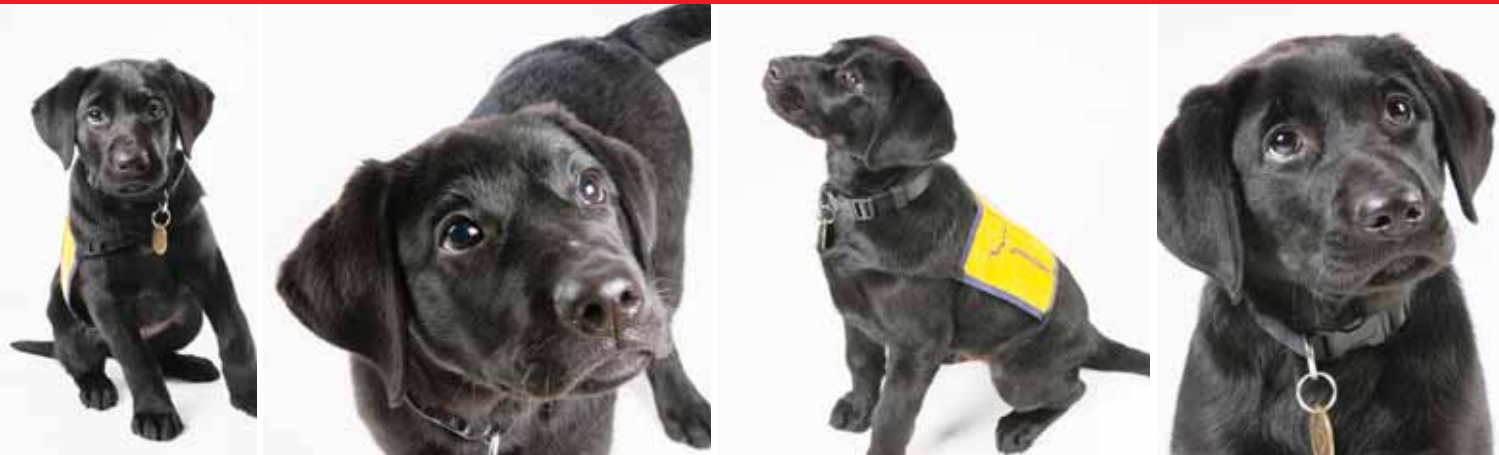
Koda goes through her paces for the camera

Would you like to sponsor and support a Guide Dog puppy or Autism Assistance Dog puppy along its journey to potential graduation? Call 1800 Guide Dogs (1800 484 333)