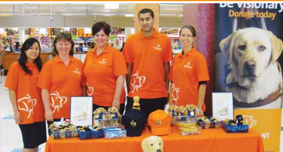
Deloitte NT volunteers on Top Dog Day