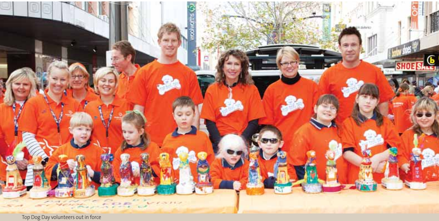
Top Dog Day volunteers out in force

Guide Dogs puppies are always guaranteed to attract a crowd – and our annual Top Dog Day 2010 was no exception.