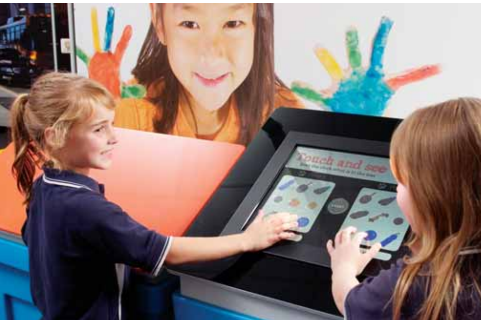
Touch and See